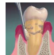
Perioscopy Using the Dental Endoscope